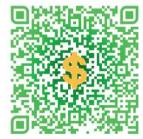
Give at grefc.org