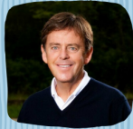
Alistair Begg, "Leaving a Legacy"

Sunday, November 17 10:30-11:30 am or Monday, November 18 7-8 pm