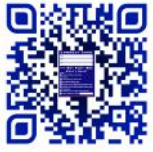
Go to the Online Connect Card

Connect: Let us know you are here, share your info, and how we can help you!