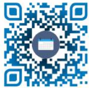
Go to the Online Events Calendar

Go online to find events for everyone in the family, with more details than what we can give in the bulletin.