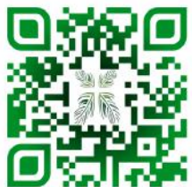
Visit us at www.grefc.org