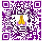
Go to the Online Prayer Card

Connect: Let us know you are here, share your info, and how we can help you!