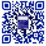
Go to the Online Connect Card

Connect: Let us know you are here, share your info, and how we can help you!