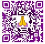
Go to the Online Prayer Card

Connect: Let us know you are here, share your info, and how we can help you!